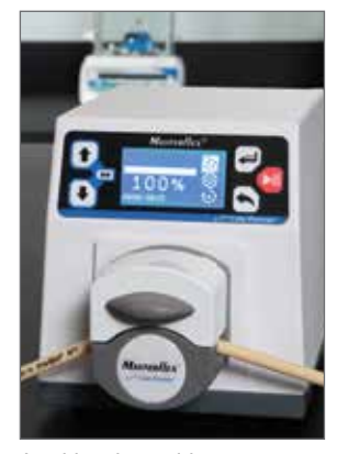
Intuitive, icon-driven interface—copy dispense progress screen shown.