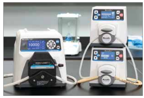
The L/S digital Miniflex pump system (aboove right) requires less than half the bench space when compared to the L/S standard digital drive (above left).

What's included: L/S Miniflex pump head and universal voltage (90 to 260 VAC) benchtop power supply with IEC320/CEE22 socket. Pump is shipped with cord/plug assembly specific to country of destination.