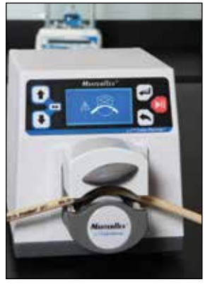
Open-head sensor stops the drive when pump head is open.